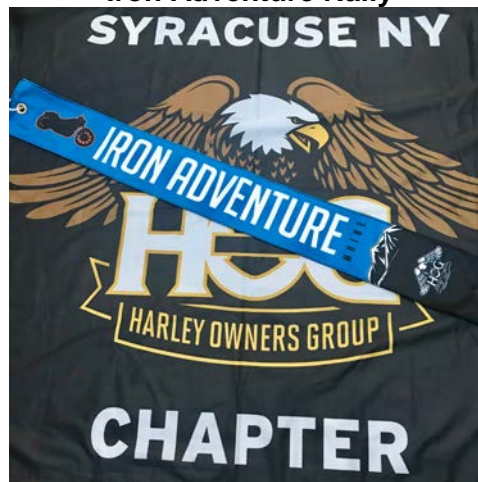
We earned our Flag Streamer

Our Trip began Aug 2 nd at PHD as we tacked on 5 days of blissful Mountain-Range Riding through the NY Adirondacks and Green Mountains of Vermont on famous scenic route 100 where covered bridges are still in use. Our ride took us into the White mountains of New Hampshire and Maine, on winding route-2 through quaint little towns with breath-taking views of New England's fieldstone walls and bubbling brooks all the way to the seas coast at Old Orchard Beach in S. Portland, Maine.