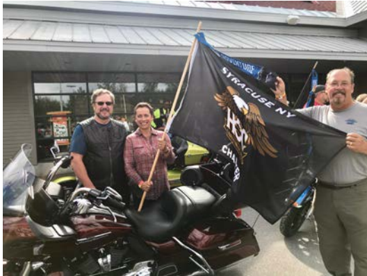
Shown off our Chapter flag with our new streamer