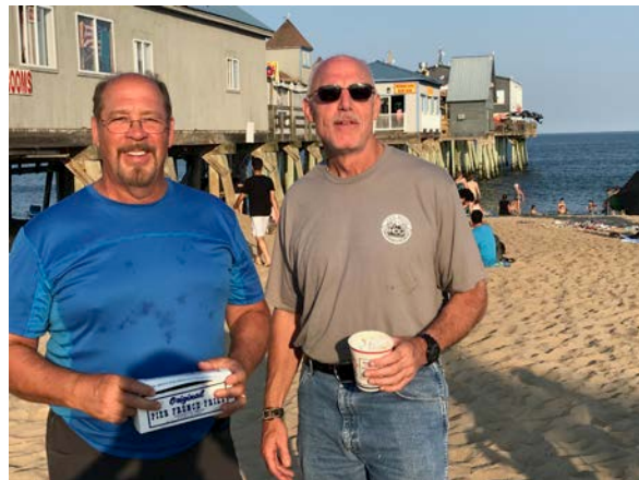
Old Orchard Beach, South Portland Maine