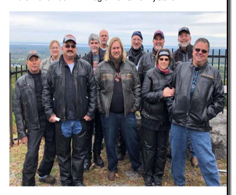
I'd like to say...

On September 30<sup>th</sup>, with rain and gray skies our club members participated in the "Ride for Clear Path". Together with more than 400 motorcycle riders and the Southern Hills Posse as event leaders, this sixth annual "Ride for Clear Path" raised $43, 570 for Clear Path for Veterans! The Ride for Clear Path features a scenic, one hour long motorcycle ride covering parts of Madison and Onondaga counties followed by a BBQ lunch prepared by the culinary program at Clear Path. More details about the raffle winner can be found in the November 21<sup>st</sup> Eagle News/PennySaver.